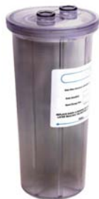
FIGURE 6 - Suction filter (after).