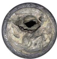
FIGURE 1 - Debris inside suction line builds over time.