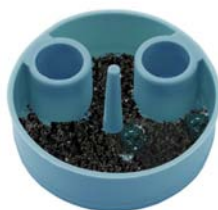
FIGURE 3 - Sludge, bacteria and debris in operator trap.