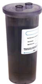
FIGURE 5 - Suction filter (before).