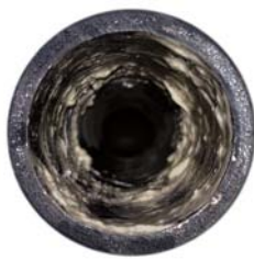
FIGURE 2 - Debris inside suction pipe after Bio-Pure Microbial Cleaning.